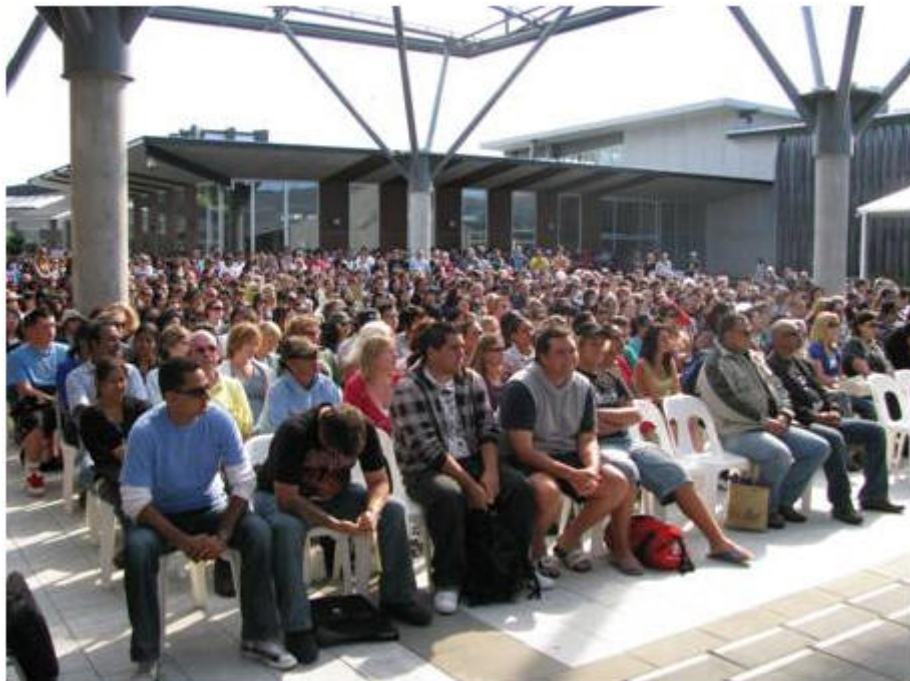
New students get welcomed under the Atrium at Porirua Campus.

Orientation activities included DJ and acoustic performances, pizza eating competitions, sumo wrestling and bull riding on a mechanical bucking bronco. New students at Kapiti Campus, Lindale and Wellington Performing Arts Centre were also part of activities, you can view these at the Whitireia Facebook page http://www.facebook.com/pages/Whitireia-Community-Polytechnic/150466150184