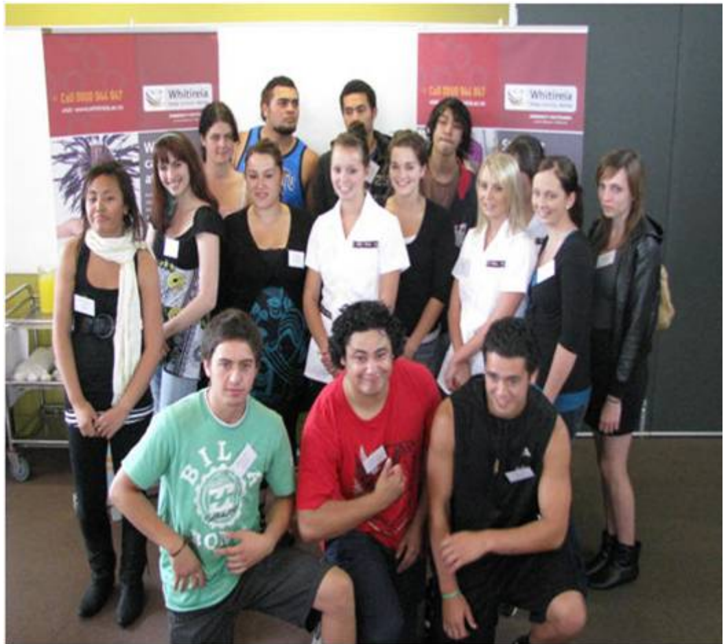
2010 Scholarship afternoon tea, Porirua Campus.