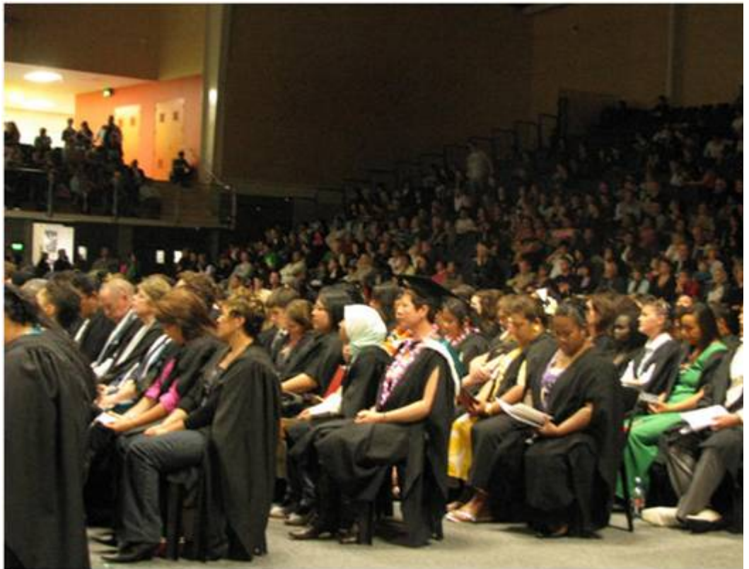
Graduation December 18 for certificate and diploma students at Te Rauparaha Arena.

We have sent you this newsletter as we believe you are interested in developments at Whitireia. Please contact us on marketing@whitireia.ac.nz if you wish to unsubscribe.