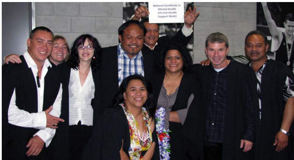
Graduates from the National Certificate in Mental Health