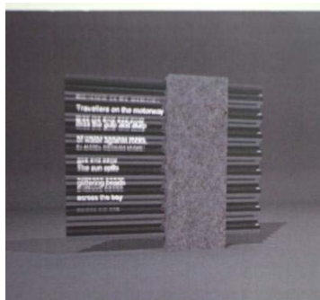
Concept Three Robin Fry 2002 47 Porirua Harbour