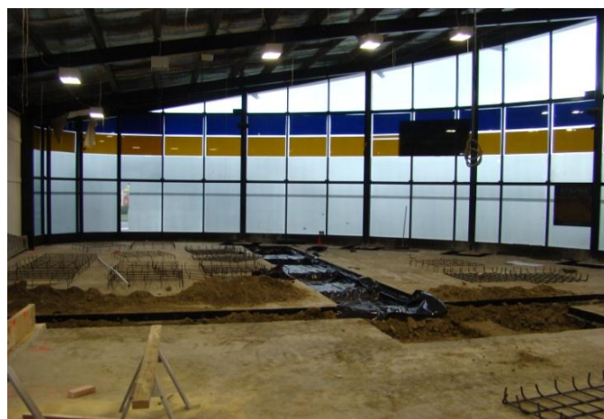
Concrete is being dug up and key services are being installed