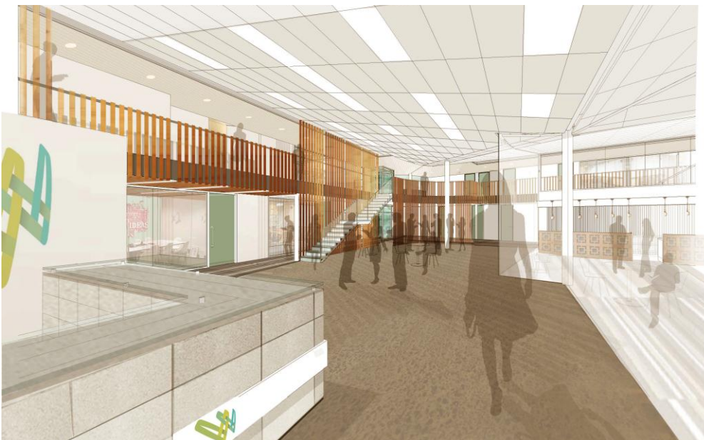
Artist's impression – internal view of the new Kāpiti campus

Whitireia has a comprehensive plan in place to see the development of this campus through. As major milestones are reached we will bring you updates on these, the progress that this new campus is taking and how it is shaping up. Our goal is to have the new campus operational in January 2012, ready for the start of the new academic year.