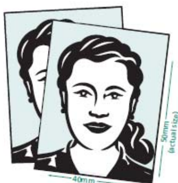
ATTACH 2 PHOTOS

I authorize Immigration New Zealand and the Department of Labour to provide Whitireia New Zealand with any personal details regarding my immigration status, including any information that I have submitted to Immigration New Zealand in the course of any visa or permit application.